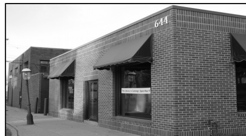
644 Lovett, SE. East Grand Rapids.

Library Moves to a Temporary Location During Expansion and Renovation. Approximately 2,000 square feet of popular space!